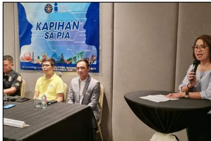
PIA-Camarines Sur conducts Kapihan with DTI and BFP

The PIA Regional Offices also organized and attended a combined 809 press conferences in 2022. To further communicate government programs and policies, the PIA also facilitated 1,576 radio and TV interviews.