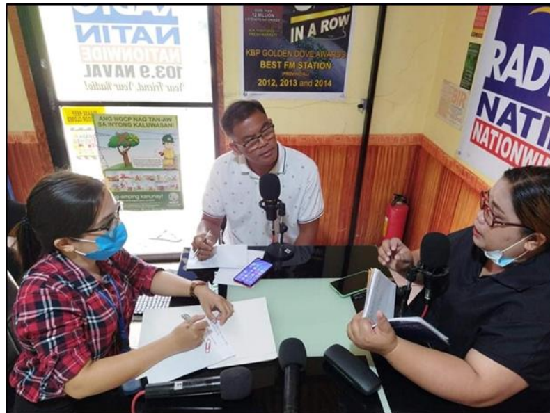
PIA-Biliran's Pulong-pulong ng Bayan radio program with official from PDEA

PIA Regional Offices conducted regular radio programs and cable TV programs. PIA Regional staff hosted and anchored these programs with their invited speakers to discuss various topics and issues in their field of expertise. In 2022, the PIA Regional Offices aired a total of 3,262 radio episodes and broadcast on 963 cable TV programs.