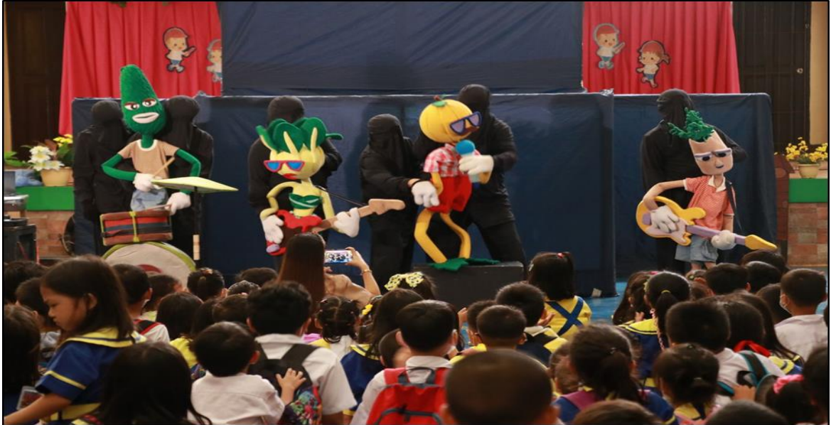
PIA conducts a puppet show for National Children's Month in Mandaluyong City

Puppet shows were also conducted to effectively communicate developmental information to the people, particularly the young audiences. These shows were often held in schools and other localities. As the government gradually loosened the COVID-19 restrictions, the PIA's Creative and Production Services Division (CPSD) conducted 21 puppet performances and produced 17 puppet videos.